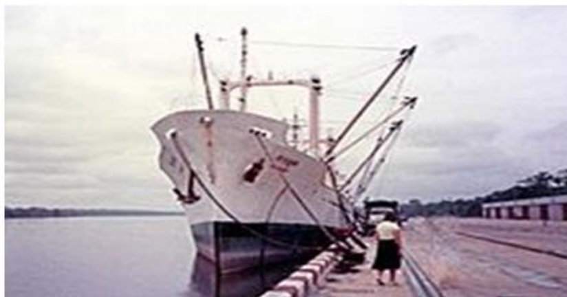
Figure 2: Calabar River Port in 1981

Calabar today has regained its importance as a port with the completion of roads providing good access to South-Eastern Nigeria and Western Cameroon. Exports include palm produce, timber, rubber, cocoa, copra, and cassava fibre. Industries include sawmills, a cement factory, boat builders and plants to process rubber, palm oil and food. Artisans make ebony artifacts for the Lagos tourist market (see Figures 2 and 3). The development of the port, and the neighboring Calabar Free Trade Zone and Tinapa Free Zone & Resort have been held back in recent years by bureaucratic problems, and also by poor power supply, poor roads and lack of dredging of the shallow Calabar River channel (Nigerian Pilot, 2010).