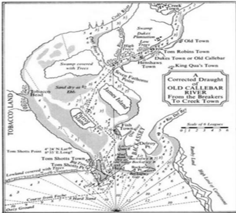
Figure I: Map of the Cross River Estuary